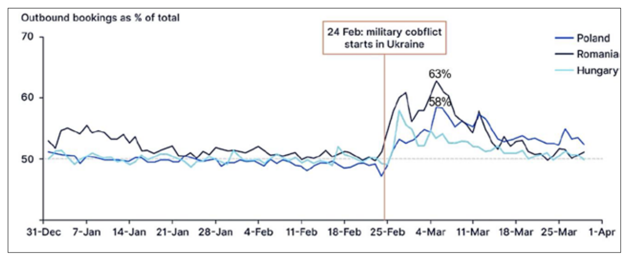
Fig. 2. Analysis of in-and outbound travel in Ukraine's neighbors

outbound flights as refugees move by air to locations farther afield. In the first weeks of the Russian's invasion of Ukraine, airlines increased capacity out of these three countries by increasing frequencies larger aircraft onto these routes, fig. 2 [7]. Atlas Obscura said Romania, which borders Ukraine, was among the top-selling trips in the May.